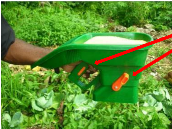
Typical hand held bait spreader showing the winding handle and the aperture adjustment Set the aperture at “1”.

These are available at low cost from hardware and pesticide stores. They feature a hopper for holding the bait, a winding handle that agitates the bait and scatters it over the ground, and an adjustable aperture that is used to calibrate output. These spreaders are also used to scatter seeds and fertilizer.